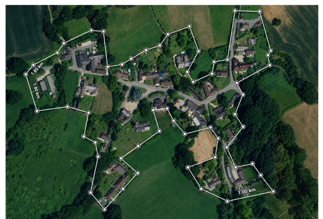
Figure 2 2.0 km fibre ring serving individual properties around Gittisham.